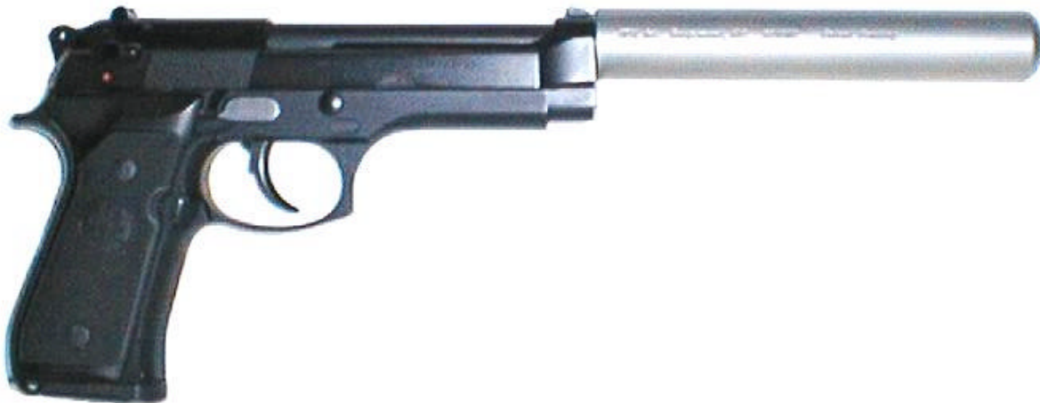
Beretta 92 with suppressor

Price: Screw on model - $875.00 With 3 lug coupler - $950.00