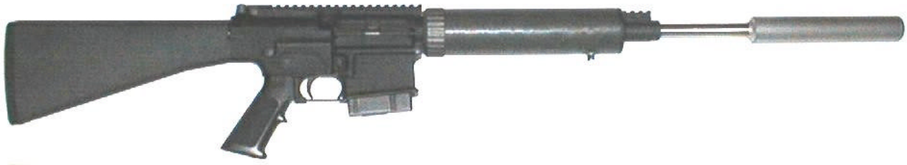
AR10 with screw on suppressor installed Patent Pending

Phone: (919) 471-6778 Fax: (919) 471-3314 Email: raymonda@earthlink.net