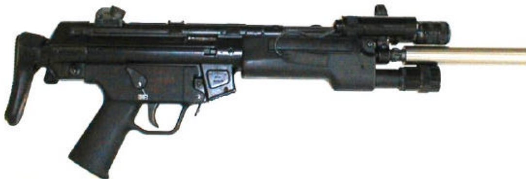
MP5 with suppressor, SureFire hand guard with light and laser