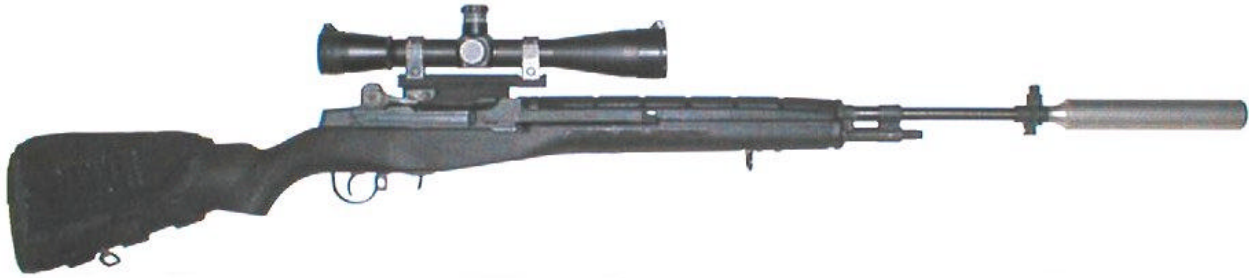
M14 with suppressor installed Patent Pending