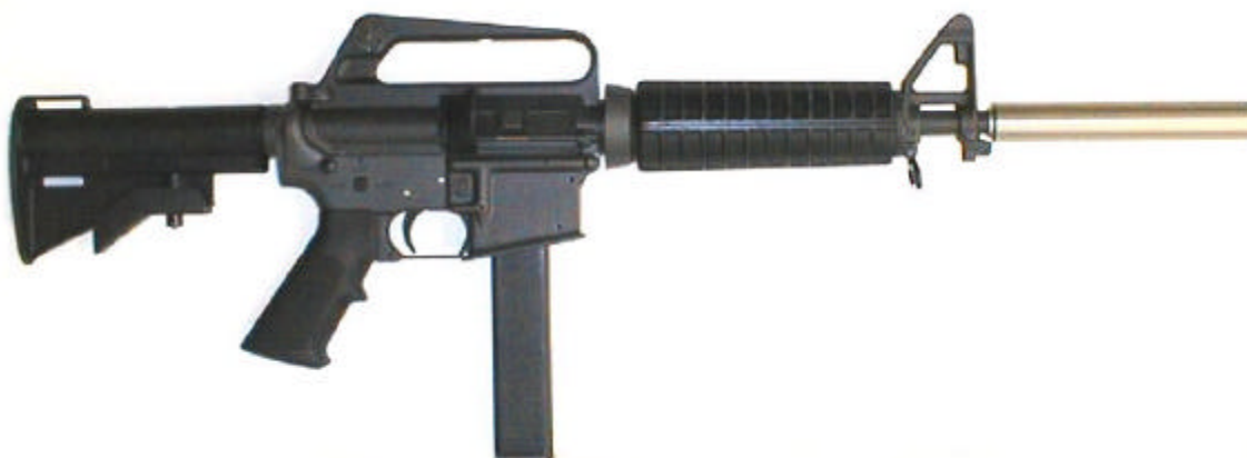
Colt 9mm with suppressor