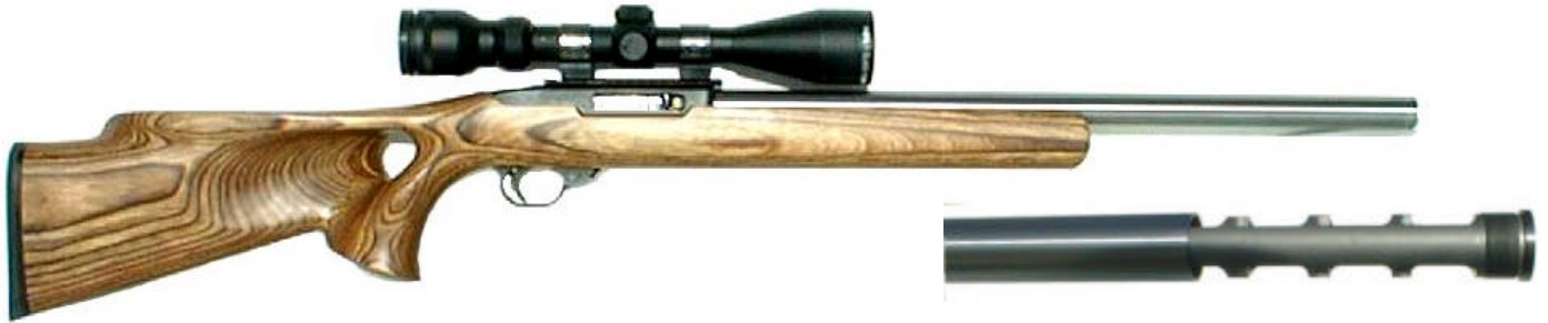
Ruger 10/22 on Fajen thumbhole stock with suppressor unit installed

Phone: (919) 471-6778 Fax: (919) 471-3314 Email: raymonda@earthlink.net