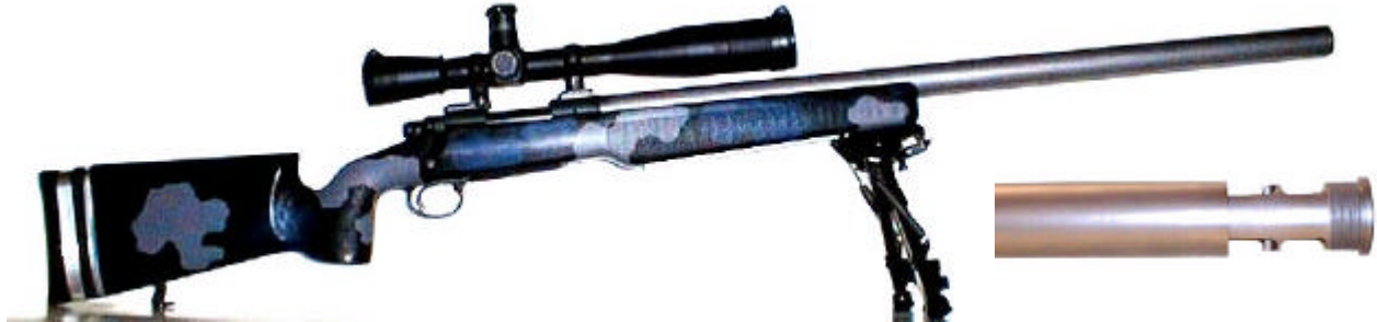
Rifle with suppressor unit installed

Phone: (919) 471-6778 Fax: (919) 471-3314 Email: raymonda@earthlink.net