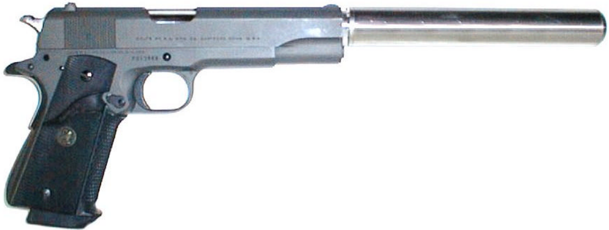
Model 1911 with suppressor installed.

Phone: (919) 471-6778 Fax: (919) 471-3314 Email: raymonda@earthlink.net