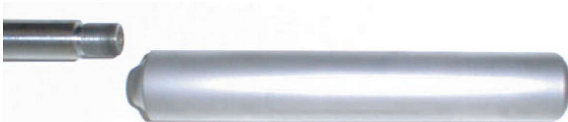
Close-ups of suppressor Patent Pending